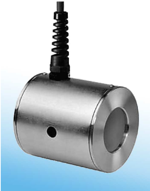
Fig. 1 Electromagnetic flow Sensor mag-flux S